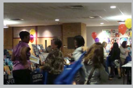
The Vendor Area at the Conference