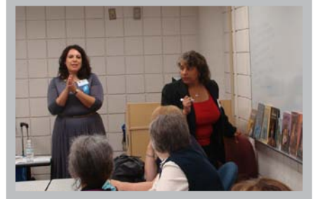
Workshop: Listening, the Cinderella Skill Often Neglected