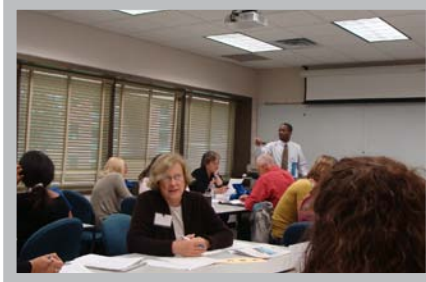
Workshop: Motivating Your Adult Learners