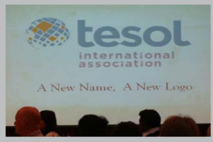
TESOL International Association. A new name. A new logo.