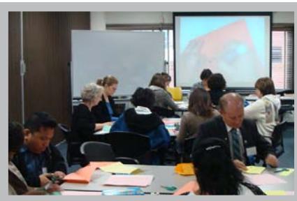
Workshop: Fun with Foldables, Alternative Assessment Ideas for Your Classroom