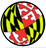
Photo Highlights From MDTESOL Fall Conference 2011