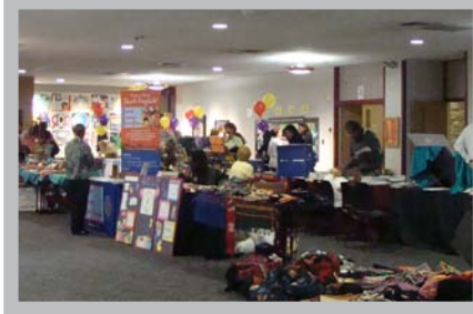
The Vendor Area at the Conference